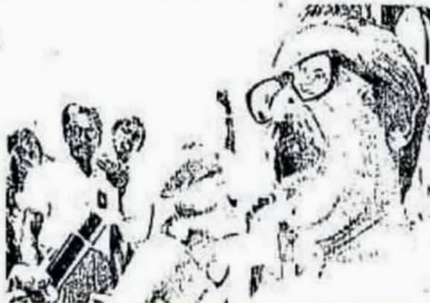
SPEAKING TO SUPPORTERS —Sheikh Mujibur Rahman, leader of Awami League, addresses rally in Dacca Wednesday. On Friday, Rahman proclaimed independence for East Pakistan as civil war broke out in country.

United News of India, in a dispatch from the east Indian state of Assam, reported heavy casualties in the coastal capital of Chittagong. It said about 300 East Pakistanis had been killed across the border by troops. Other reports from the border area