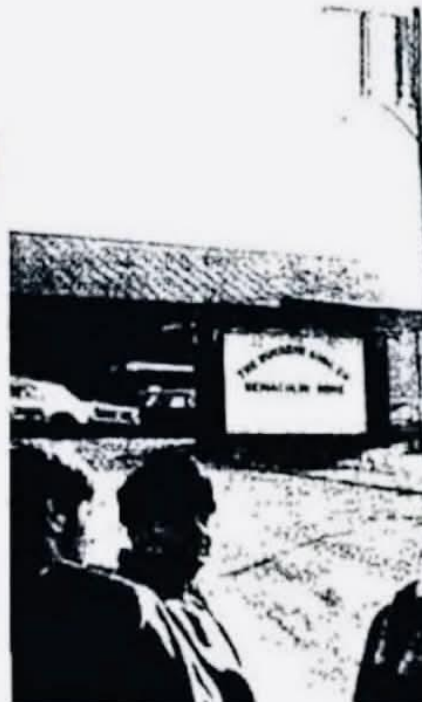
ENTRANCE OF NEMACO

The Press Trust of India, this country's main news agency, reported that at least 10,000