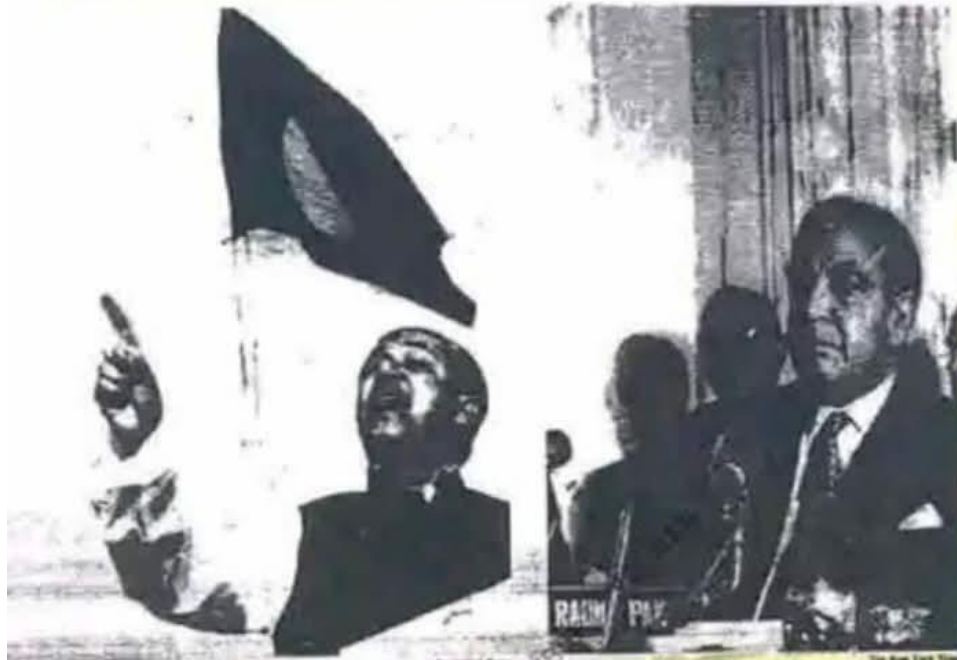
BEFORE OUTBURST: Sheik Mujibur Rahman on March 7 in Dacca. Flag is that of rebellious group he leads.